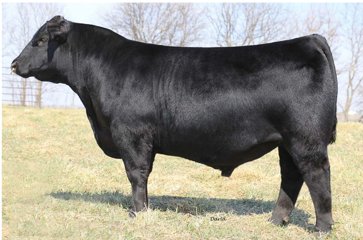
BC ROBUST 0807