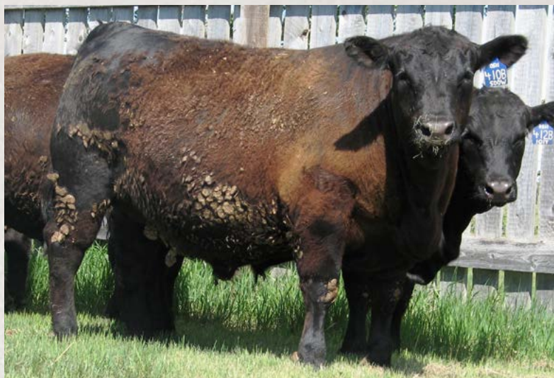
Figure 1: Feed Efficiency and Carcass Research Trial, Lacombe Research Centre, AB. Steer sired by Chapman Memento 0511X.

"The other factor is sire selection," he says. "Herd sires that control frame, but support desired gain and carcass characteristics, need to be utilized. As a caution, decreasing the size of cattle is easy to do, thereby decreasing herd performance. However, the astute producers understand the genetics of cattle size and only then set out to decrease cow size with increased herd performance."