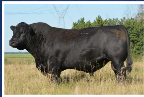
X0 CROWFOOT EQU 268Z

Crowfoot Equation 5793R x Crowfoot 6071S