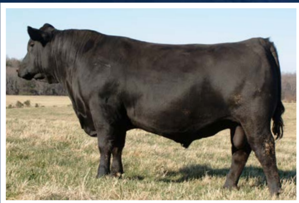
WRA CEDAR RUN D2